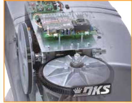
unique design simplifies installation and provides easy access to all internal parts