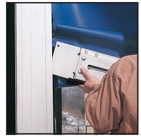
Easily resets, without the need for tools