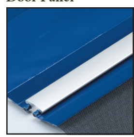
Integral wind rib with optional screen material