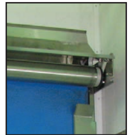
Hinged drip guard lifts up for easy cleaning