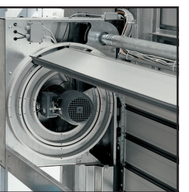
Compact AC Drive Motor